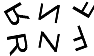
Figure 1. Examples of the mental rotation task.

Z, R, F, N, P, S. Each individual task was represented as the sixteen versions of a particular letter arranged in a 4x4 matrix printed on an A4 portrait sheet of paper. The order of the true and false versions as well as the order of the eight different angles of rotations was randomized across the six tasks. The order of the six tasks was randomized across participants. Since subjects were required to make a judgment for each letter version in each task (i.e. subjects were asked to indicate whether a particular version was a rotated original letter or a rotated mirror image of the original letter) there were 6 \times 16 = 96 judgments made by each participant in the attributional condition. A sample of three letters is presented at figure 1. The top three letters represent instances of the false alternatives and the bottom three letters represent instances of the true alternatives.